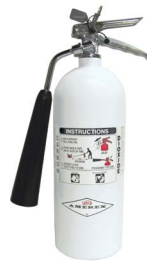
Model 322NM NON-MAGNETIC