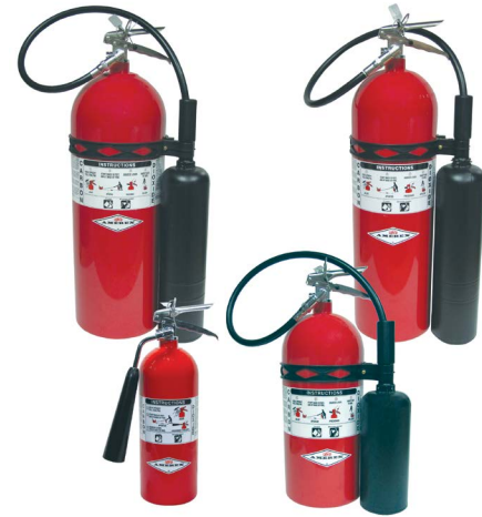
Models 332 331 322 330