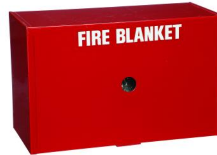
Horizontal Drop Cabinet 9613S21

Surface-mounted tub and solid metal door. The Royal series is available in red epoxy-painted CRS only. Door hardware includes zinc-plated pull handles and roller catches.