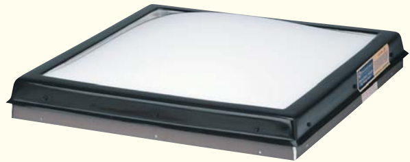
Fixed Model ASV

B ristolite's thermally broken Thermo-weld® seamless fiberglass framed skylight features the energy efficiency of an extruded PVC curb-mounted base for extreme climates. These models are available fixed (as shown) or manually openable.